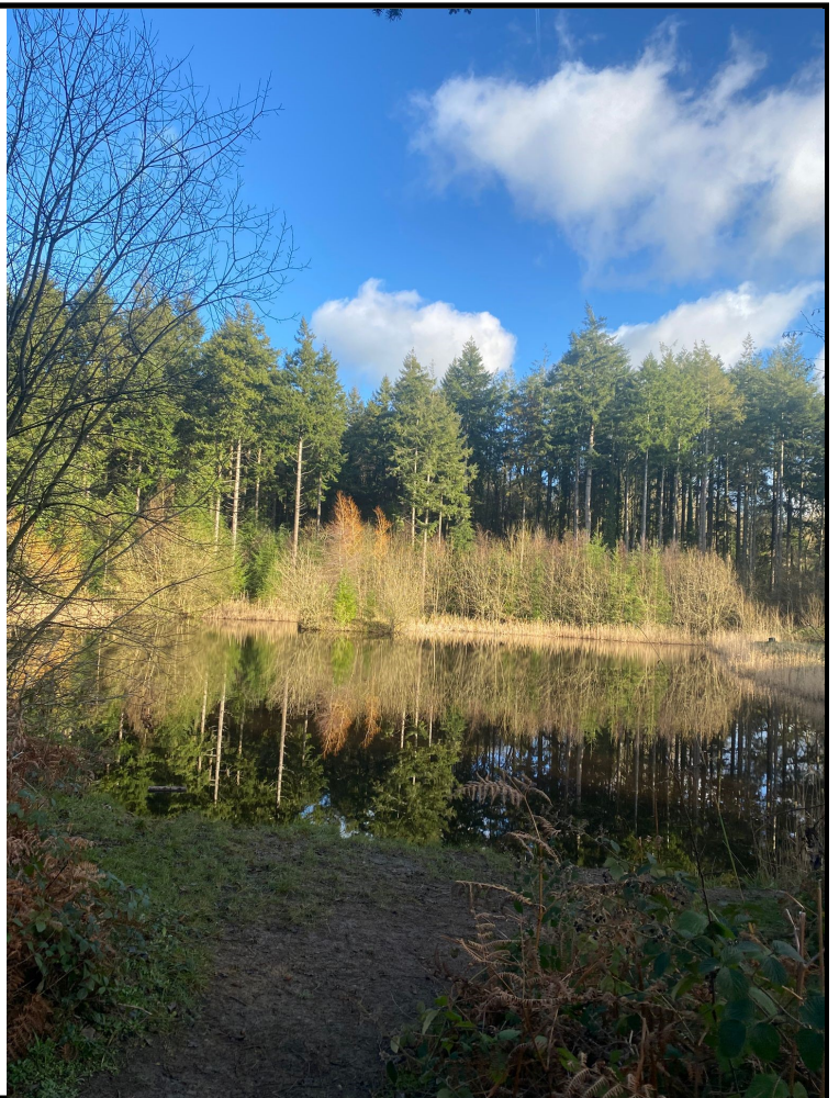
at Pen Selwood