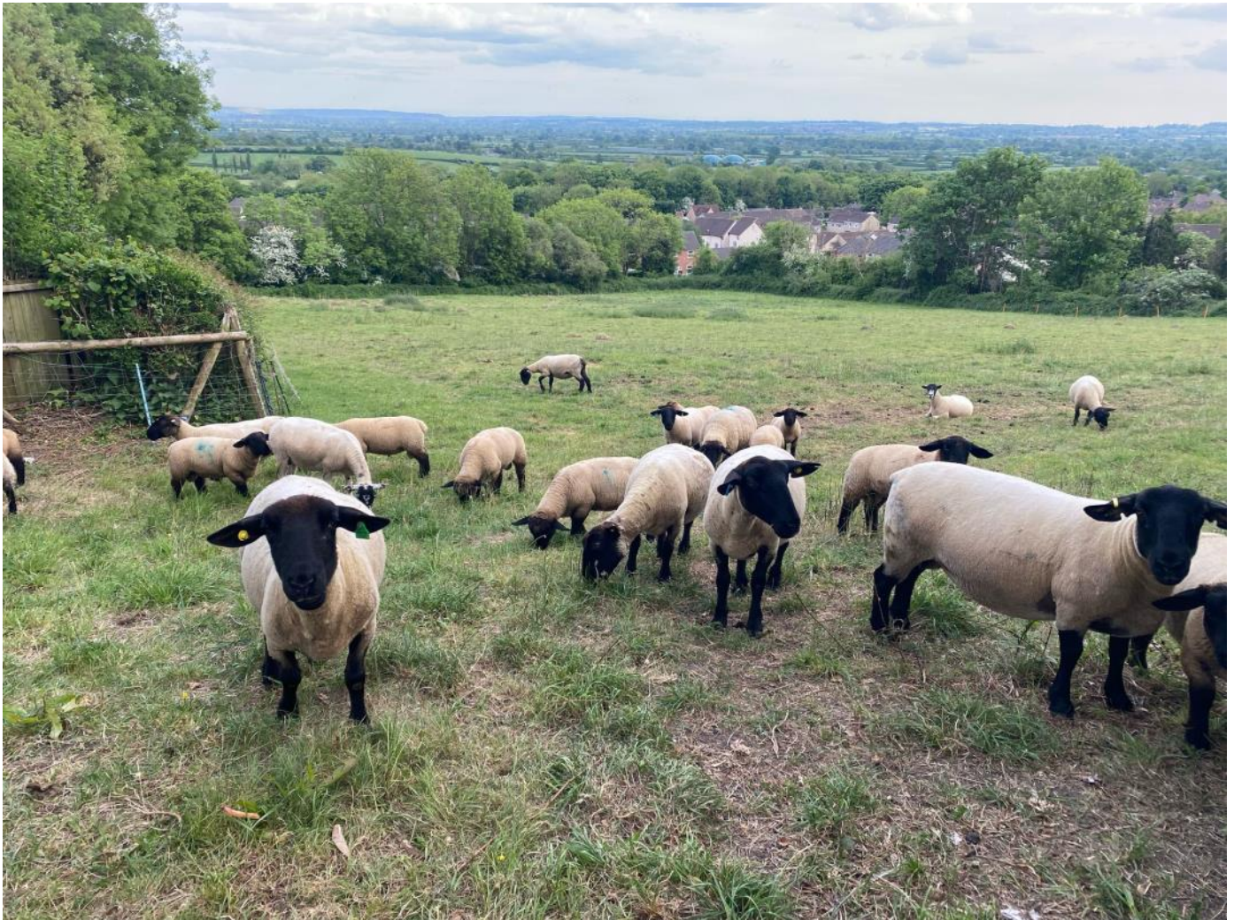
at Bayford Hill Viewpoint

Published free by your churches as a service to the community, donations to treasurers welcome.