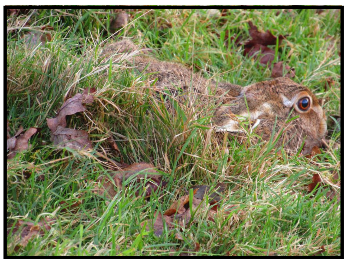
Brown hare in Charlton Musgrove January 2025

Published free by your churches as a service to the community, donations to treasurers welcome.