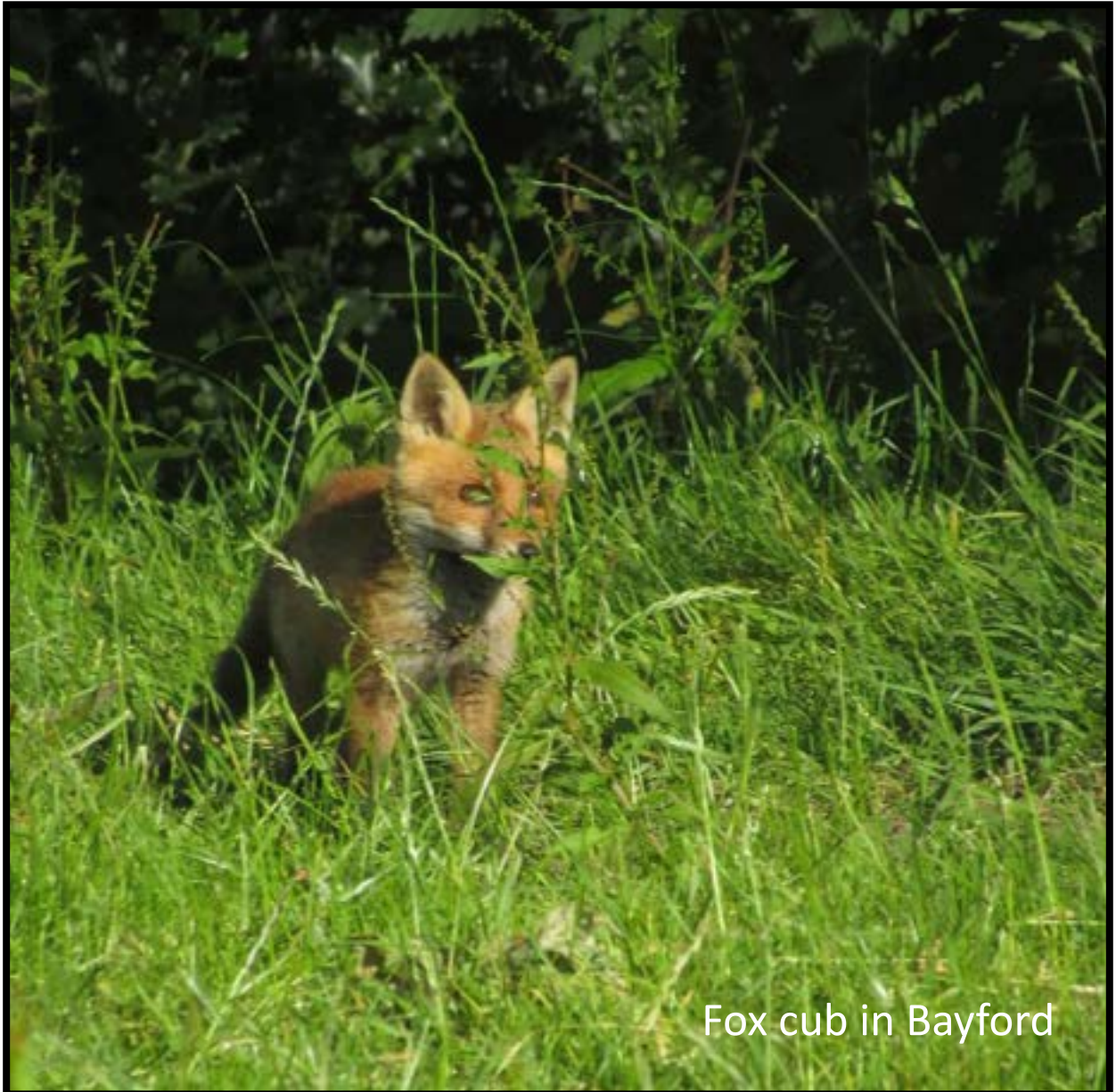
Fox cub in Bayford

Published free by your churches as a service to the community.