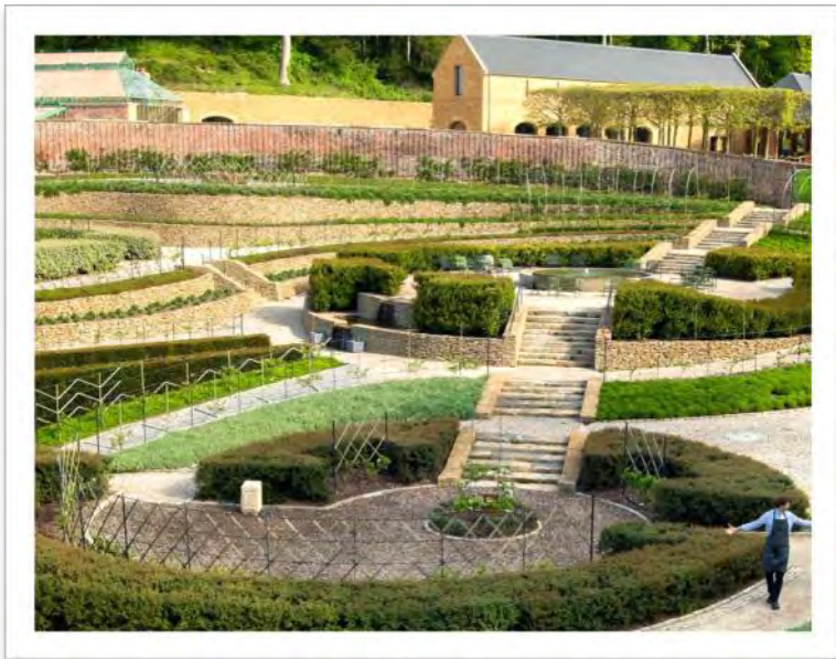
The Newt Gardens & Grounds

For the parishes of Charlton Musgrove, Cucklington and Stoke Trister with Bayford