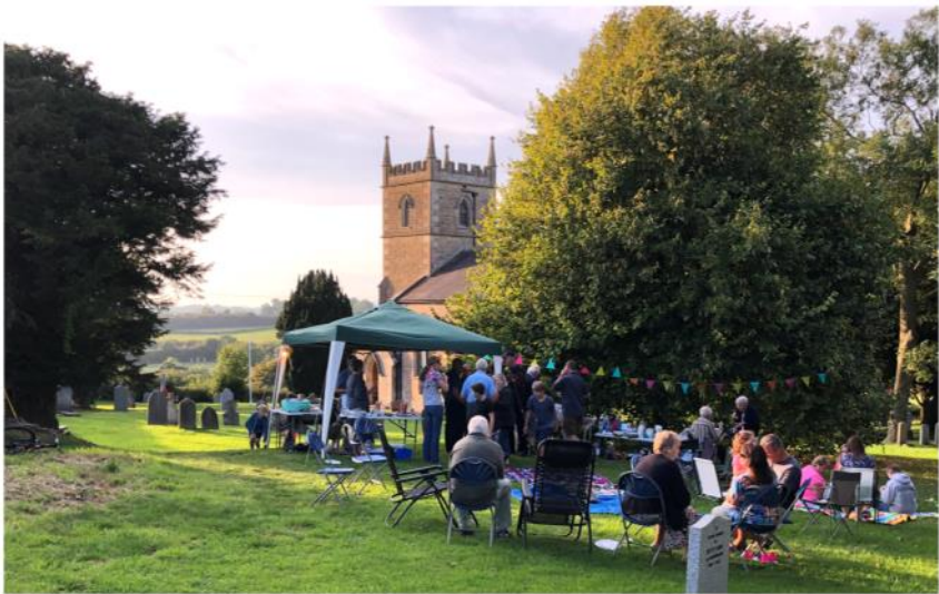
Evening barbecue at St Andrew's

For the Parishes of Charlton Musgrove, Cucklington & Stoke Trister with Bayford